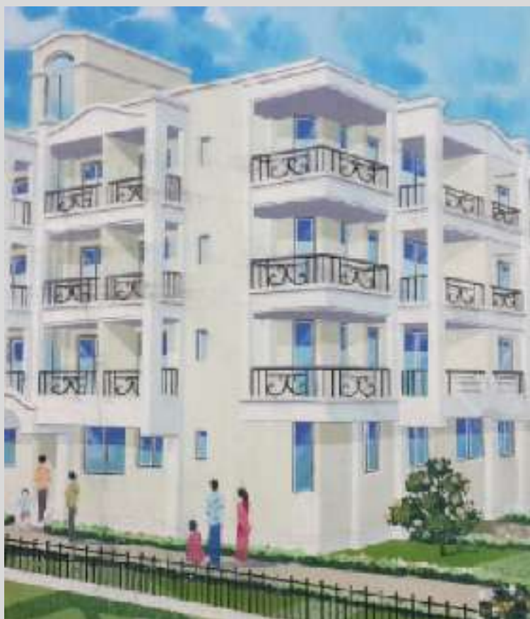
Naga Residency , St. John's Road, Bangalore