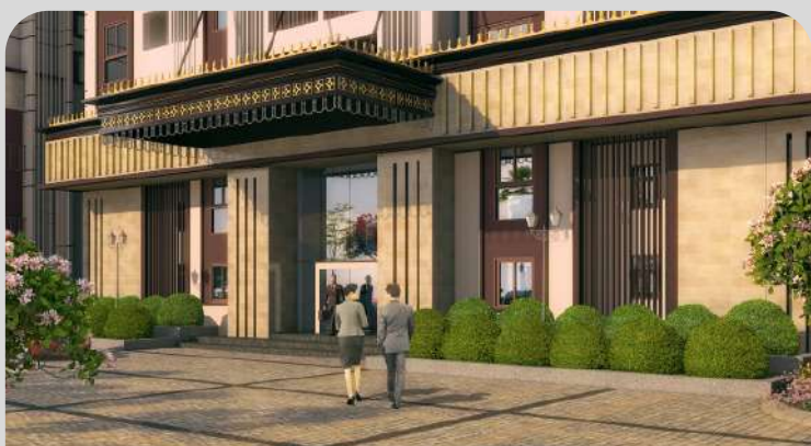
The Hub Club @ Ohana