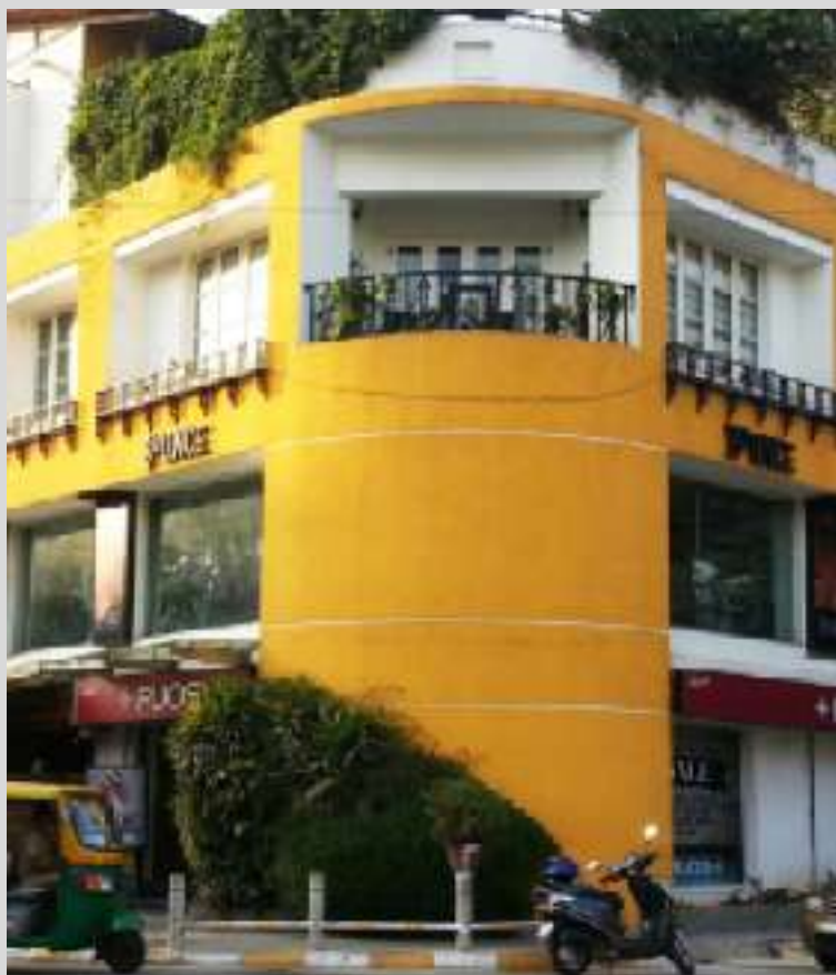
Magnolia, Lavelle Rod, Bangalore