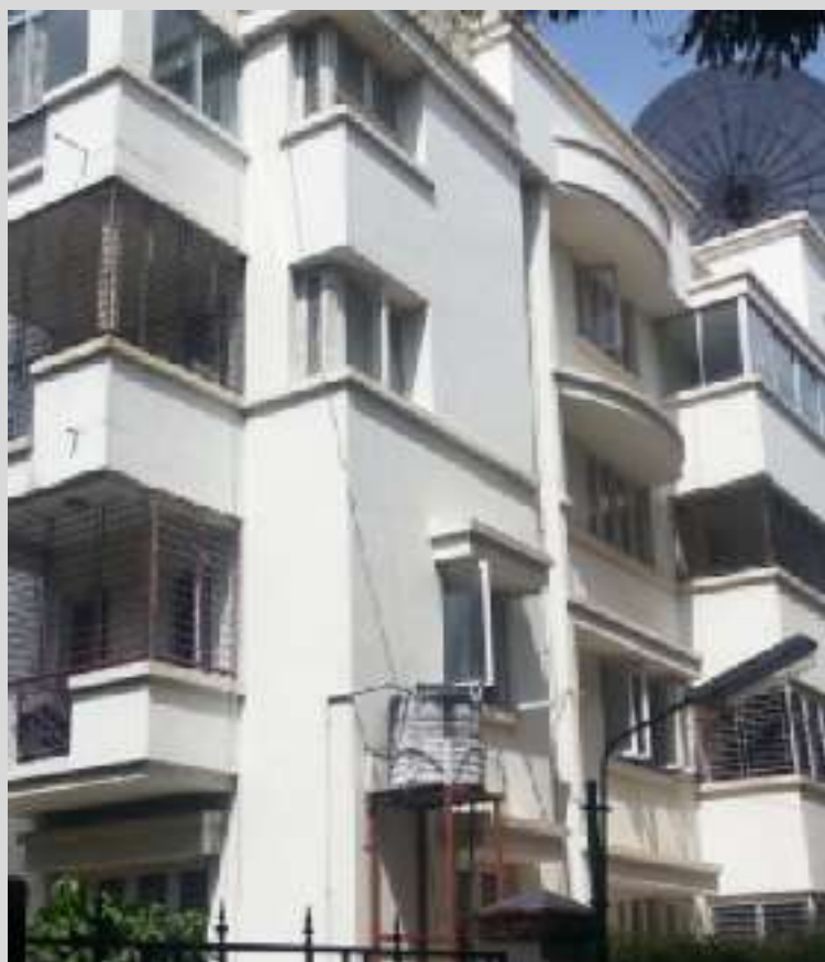
Fair Haven Apartments , St. John's Road, Bangalore