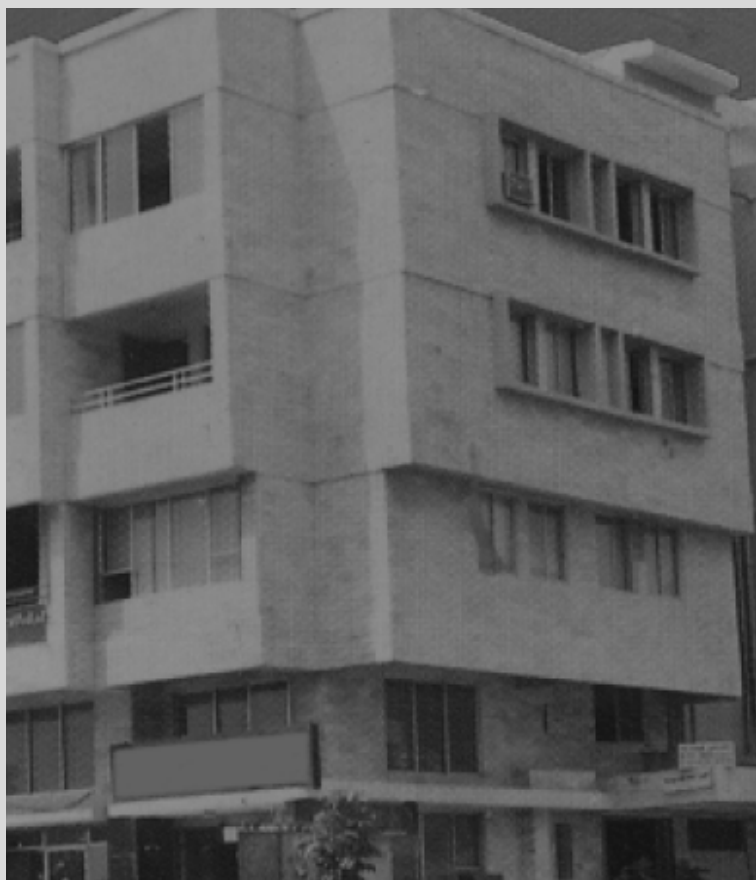
Ahuja Chambers, Kumara Krupa Road, Bangalore