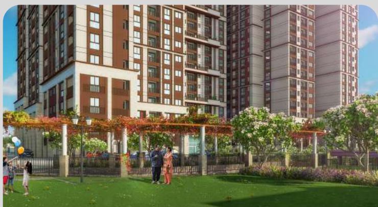
Ohana - Manicured Gardens