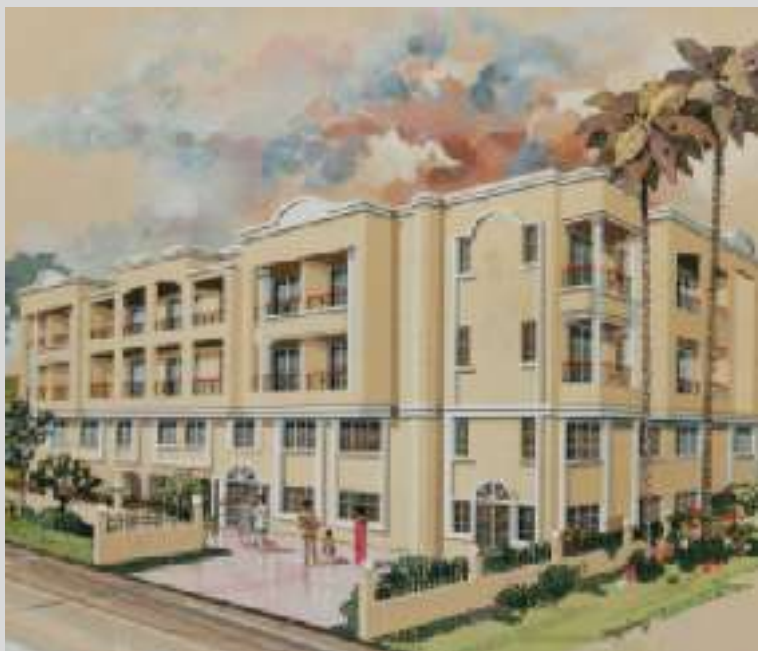
Ahuja Palace, Richmond Road, Bangalore