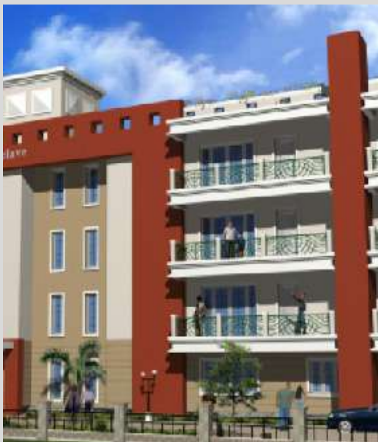
Ahuja Enclave, St. John's Road, Bangalore