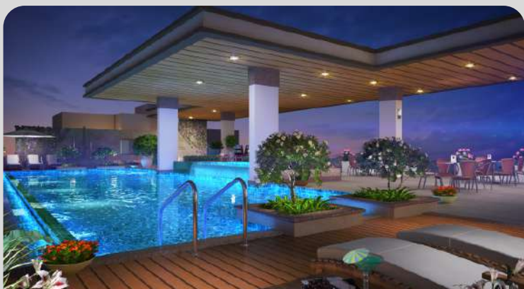
Ohana - The Sky Pool