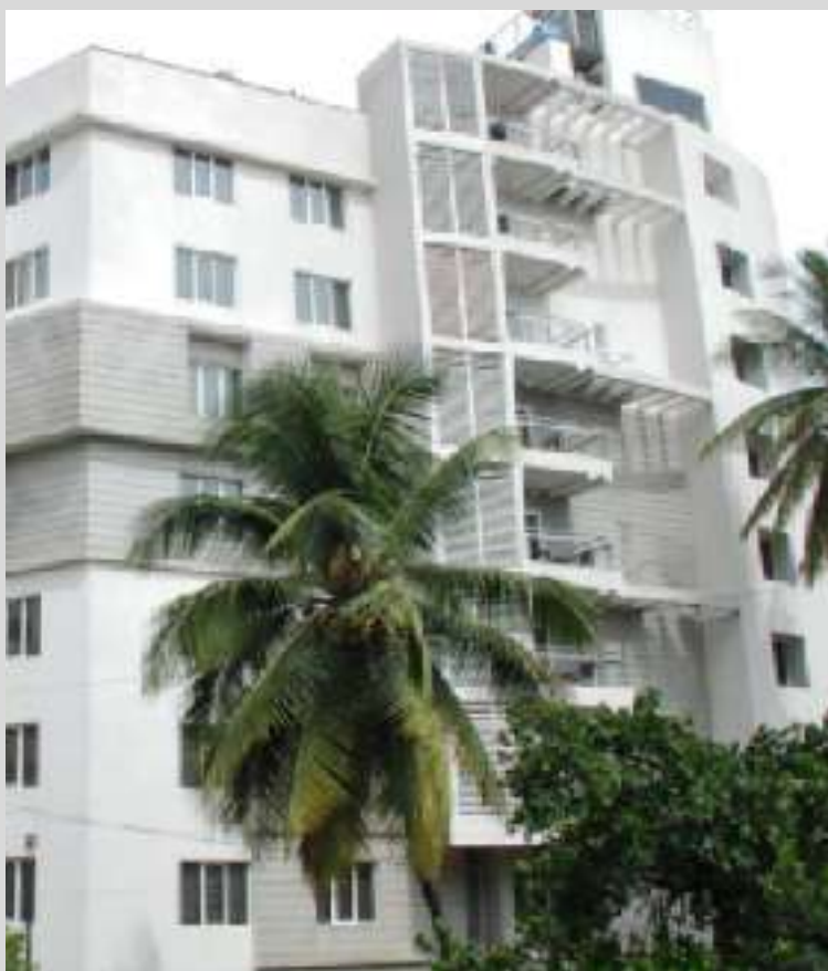
Astris, Richmond Road, Bangalore