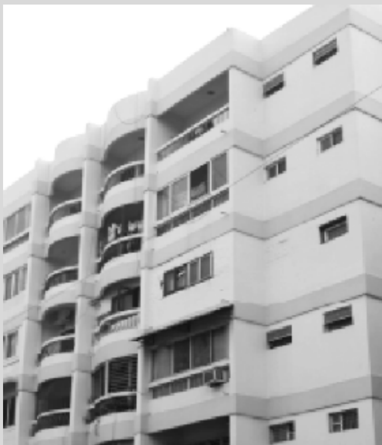
Sterling Apartments, St. Mark's Road, Bangalore